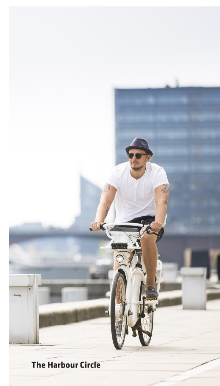
The Harbour Circle