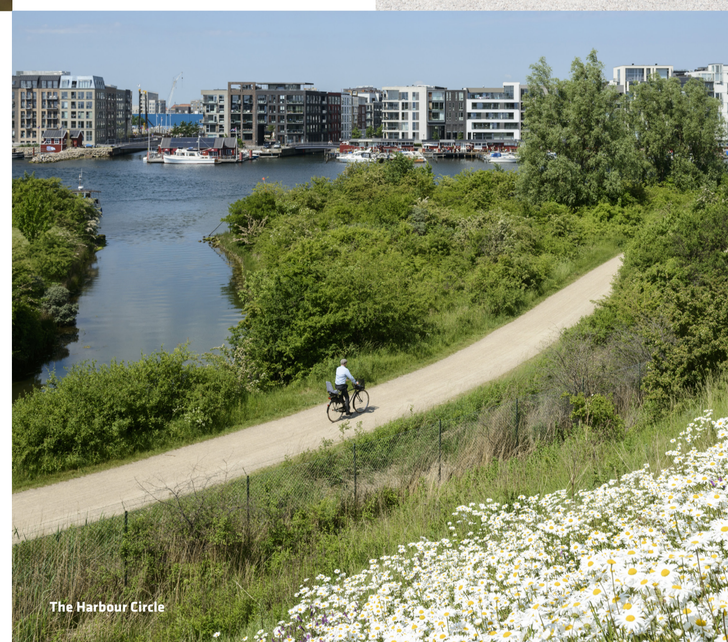
The Harbour Circle

From Åbuen, which is the bridge that connects Copenhagen and Frederiksberg, the path continues through Frederiksberg and two large campus areas, the Faculty of Life Sciences and Copenhagen Business School. This part of the route is called "the Green Path".